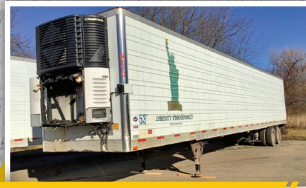
2004 UTILITY, 53'