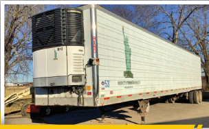
2004 UTILITY, 53'