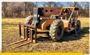
CASE VR-642, 7,020 hrs.

PREVIEW: March 7 from 9AM-4PM / LOADOUT: March 15 from 10AM - 4PM and March 16 from 9AM-4PM