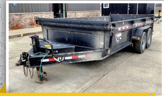
PJ, low pro dump