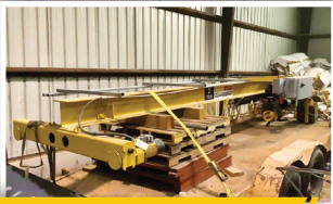
2017 CES/WECO, 18-1/2'x6'