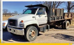
2000 GMC 6500, 68,761 mi.