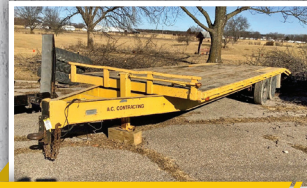
1995 MAC-LANDER 25LFF8, 20'