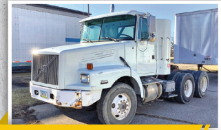
1998 VOLVO WG, day cab