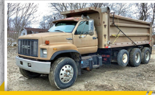
1996 GMC TOPKICK, 486,169 mi.